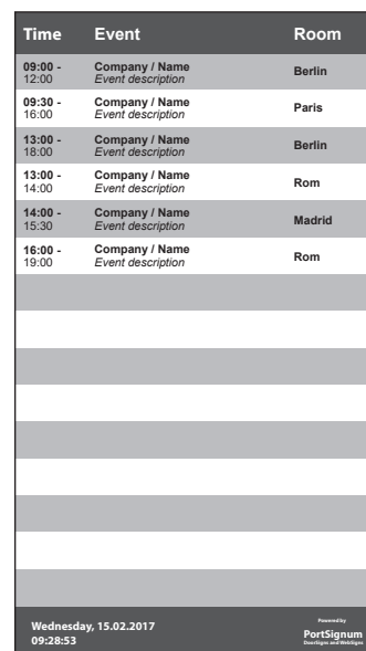
Layout for portrait without floor plan. Display of 15 events.

Note: A room!MATE SignPost screen consists of a monitor with FHD resolution and a small SignPost controller. PortSignum is supplying the Sign-Post controller, which is connected to the monitor via HDMI or DVI. The monitor itself is not part of the shipment.