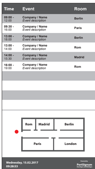
Layout for portrait with floor plan. Display of 10 events.