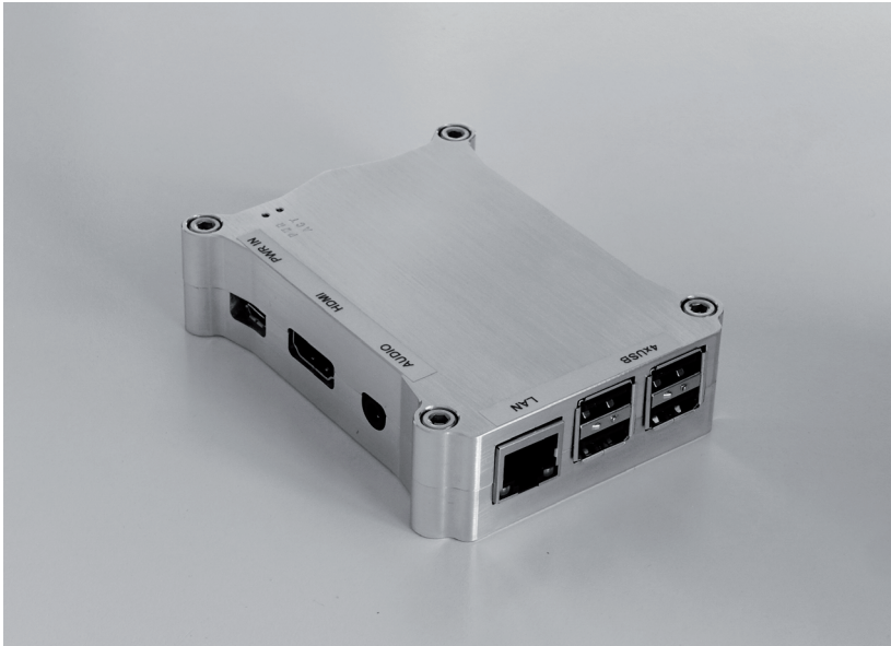
web!Master HTML Media Player

web!MASTER – HTML Media Player With HTML5 support